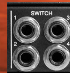
Four Function Switches control outboard gear.