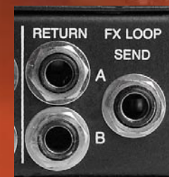
Programmable FX Loop with stereo Returns.

Each control's up and down keys work much like an old style knob... all parameters are displayed and active all the time. To you, that means no scrolling to find your Treble on the gig. You don't have to wonder how your Bass and Mid are set, you can see them from across the stage.