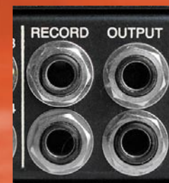
Stereo Main and Recording Outputs.