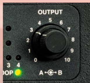
Manual Output eliminates rewires for different venues.

John Petrucci, Kirk Hammett, Adrian Belew, and James Hetfield.