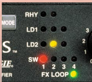
Toggle through eight different preamp circuits

TRIAXIS...Total access to the encyclopedia of TONE. Digital disbelievers scoffed at the very idea of packing five 12AX7's and 25 years of tube tone heritage into one rack space of pure magic...but there they are...five little tone bottles, glowing quietly-all too ready to rock the house.