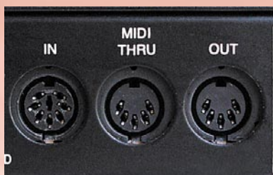
Full midi, including phantom power & data dump.